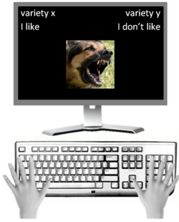
Fig. 2. Example of a trial in a P-IAT

response keys. Each response key corresponds to one of the target and one of the attribute categories (e.g. ‘variety x + I like’ for the left-hand key and ‘variety y + I don’t like’ for the right-hand key). Fig. 2 gives a visual representation of a trial in a P-IAT. The categories mapped onto the response keys are always displayed in the top corners of the screen. Depending on whether the target and attribute categories are mapped onto the response keys in a combination congruent or incongruent with one’s attitudes, categorisation of the stimuli will be easier or harder, respectively. This difference in ease of categorisation will result in a difference in reaction times in the categorisation tasks: faster responses if the mapping of the target and attribute categories onto the response keys are in line with one’s attitudes, slower responses if the opposite is true. Participants’ reaction times in the categorisation tasks are measured in two sets of trials: one set with the target and attribute categories mapped in one way, and another with the categories mapped in the reverse way. Reaction times are then compared between the two sets of trials using a scoring algorithm [14] that indicates which associations a participant holds vis-à-vis the varieties included in the experiment.