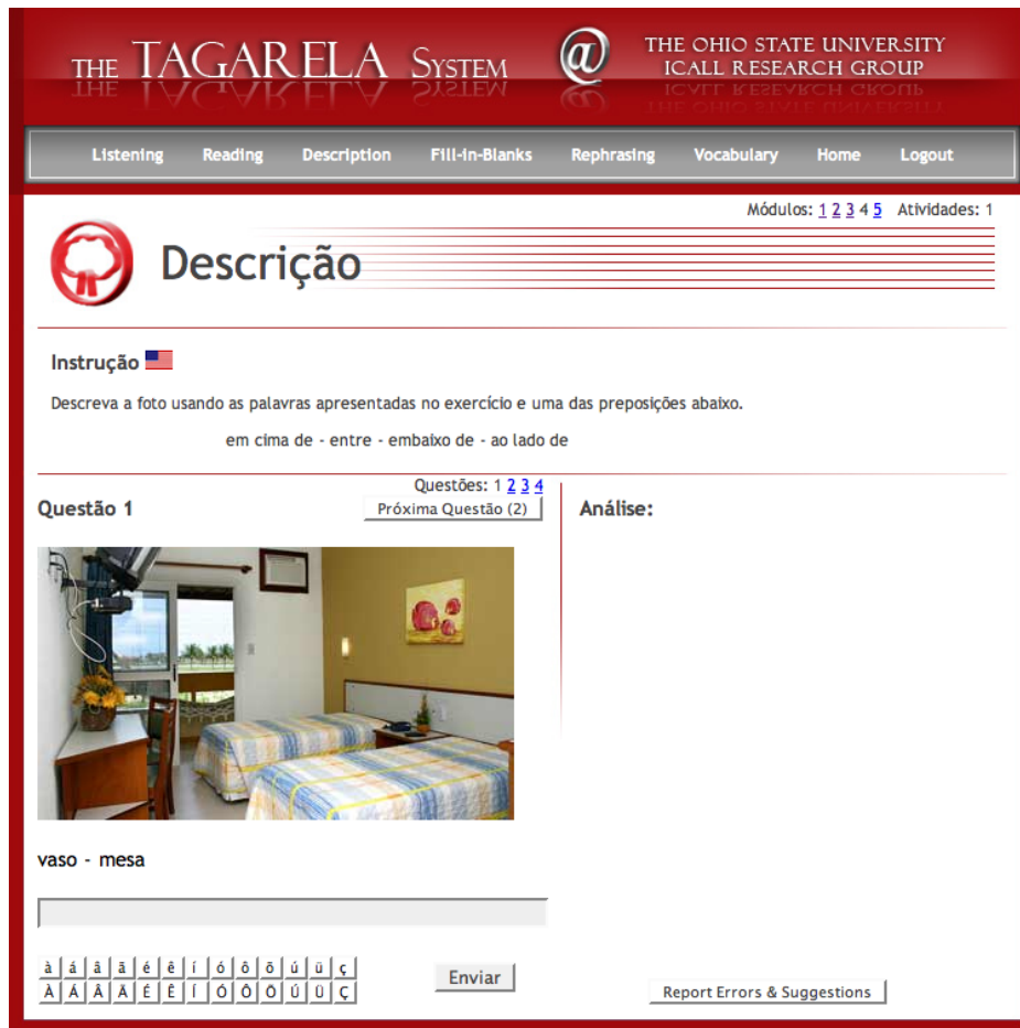
Figure 3: Description Exercise

button ( Enviar ). Similarly to other ICALL systems, TAGARELA also provides buttons with all diacritic symbols for capital and low letters. Clicking on one of those buttons inserts the accented character at the place at which the cursor is positioned in the input field.