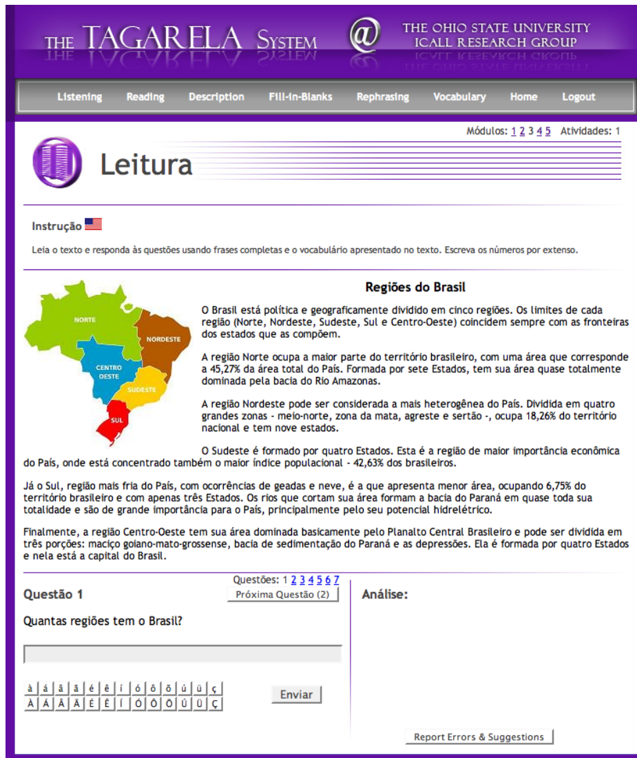
Figure 2: Reading Comprehension Exercise

Language of instruction In line with the discussion in section 3.3, we chose a hybrid approach for the language of instruction. English (L1) instructions are not avoided completely, but students always see instructions in Portuguese (L2) first. If they want to read instructions in English, they have to place their mouse point over the American flag. As soon as they move their mouse elsewhere again, the Portuguese instructions return to the screen. All activity buttons are in Portuguese, with the consistent page layout helping learners understand the function associated with each button.