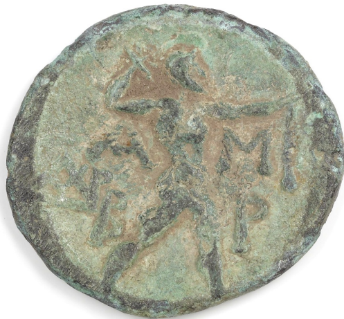
Figure 1. Unidentified Greek coin suffering bronze disease.

As a result of the partnership between the two institutions and the University of Virginia Library's role as intellectual caretaker, common library standards and practices were to be employed in the description and dissemination of the digital data. While the museum's collection is small, containing approximately 600 coins, it is fairly broad with respect to Roman coins, featuring coins from nearly every era, from the mid-Republic to the Tetrarchy (ca. 200 BC-AD 300). Thus, a site displaying the museum's collection is an invaluable tool not only for students at the University of Virginia, but also for anyone with access to the Internet and an interest in ancient numismatics.