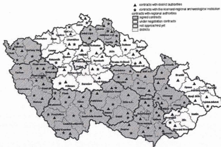
Figure 2 SAS CR - state of contractual cooperation with the old districts and the new regional authorities and the licensed regional archaeological institutions on 10.04.2003

The graphical coverage contains 20,000 graphical representations of digitalized sites. Out of the total of 4,754 maps in 1:10,000 scale, 3,959 maps (corresponding to 86 per cent of the territory of the Czech Republic) have been processed until end of 2002. Presumably more than 90 per cent of the territory will be covered before the expiration of the project at the end of 2003. For the remaining part analytical instruments in GIS environment can be used for modelling the possibilities of occurrence archaeological findings.