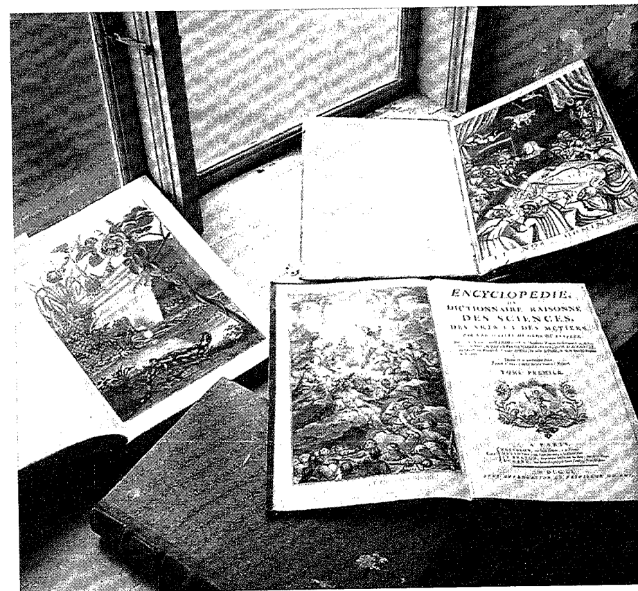
FIG. 15: Book examples from the library on the windowsill. Left: The natural history by August Johann Rösel von Rosenhof: Historia naturalis ranarum nostratium . Nürnberg 1758. Right above: Olof Rudbeck the elder: Atlantica . Right below: Denis Diderot's and Jean Le Rond d'Alembert's Encyclopédie (1751-72).

ence books on 'natural history' as this interdisciplinary subject was called at the time. 7 Examples of scientific reference literature are Mark Catesby's The natural history of Carolina, Florida and the Bahamas (1731-43), and Georg Louis Leclerc, comte de Buffon's Histoire naturelle (Natural History 1749-75, Anfält 1993: 256). Even two publications of the famous Dutch entomologist Maria Sibilla Merian are available: De generatione et metamorphosibus insectorum Surinamensium (About the Metamorphosis of Insects from Surinam 1726), and Histoire des insectes de l'Europe (Natural History of European Insects 1730).