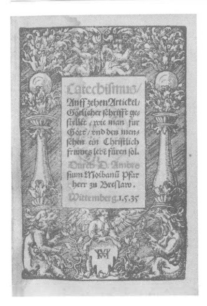
Title page of Ambrosius Moibanus, "Catechismus", Wittenberg, 1535