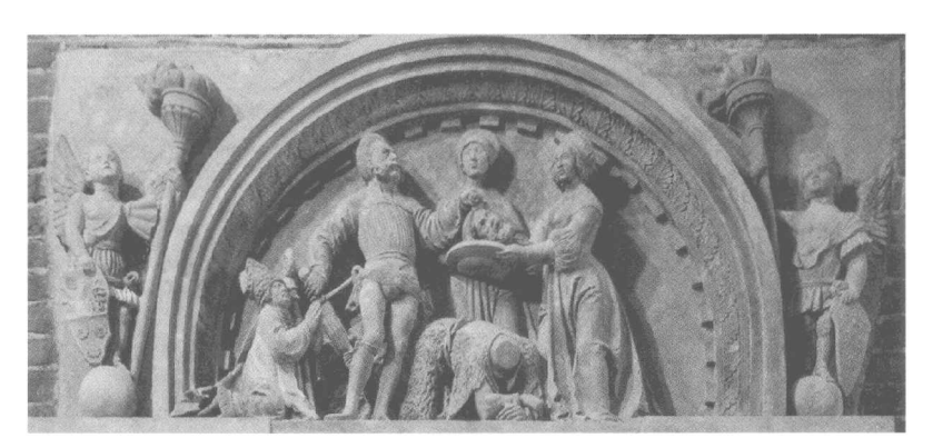
In 1517 Bishop Johann V. Thurzo had a grand Renaissance portal built for the cathedral sacristy. The bas-relief depicts the beheading of John the Baptist; Thurzo as the founder is portrayed kneeling