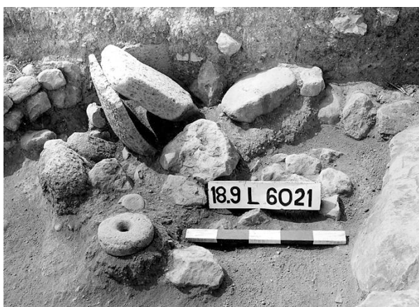
Fig. 2.9.1.2. L. 6021 features three grinding stones, in secondary use, standing upright (one is fallen) and describing a circle. On the left side the perforated stone (reg. no. 9108/50) is visible.