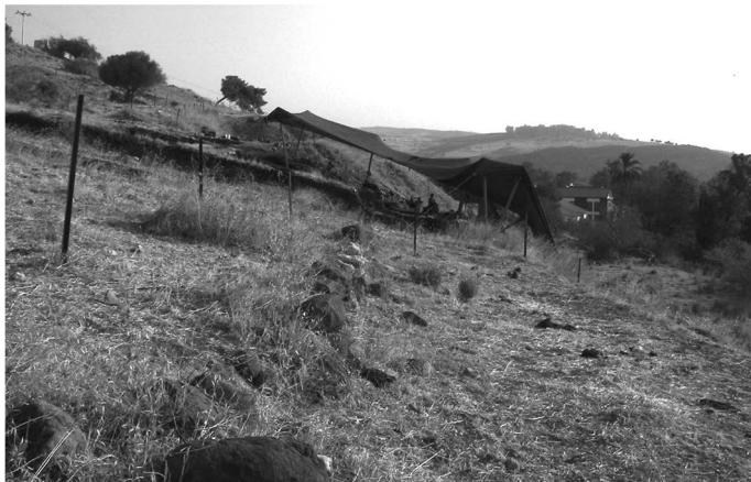
Fig. 2.9.1.1. In the center of this photo the unexcavated remains of the upper retaining wall of the Mameluke/Ottoman road (W6013 and W4017/W6156/W6250) between areas M and R are visible.

W6013 (square CE 2; local stratum M1) was visible on the surface and was the reason why the search for the assumed Iron Age I city wall was conducted here. 5 However, W6013, running parallel to the northwestern balk, was determined not to be part of the Iron Age I city wall but it is perhaps a supporting or terrace wall to hinder further erosion on the tell . Another possibility is that W6013 is a retaining wall of the Mameluke/Ottoman road which was observed in area R in Field I. 6 The course of W6013 could well fit with the course of this road. If this interpretation is correct it served as the upper retaining wall of this 4 m broad road. We were unable to date the wall fragment W6013. If it belongs to the road it can tentatively be dated to the Mameluke/Ottoman period.