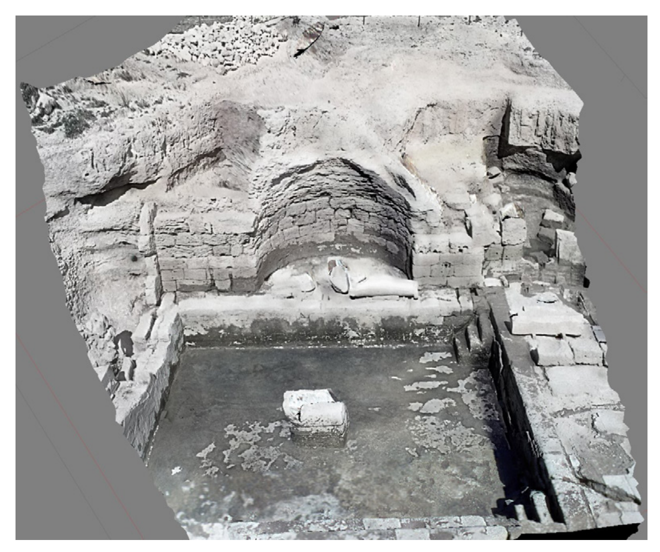
Figure 2. ountain of the Lamps 3D modelling as it was in 1972

es is intended, determines the photogrammetrist's approach to the modeling and in their assessment of available materials and whether those goals can be achieved.