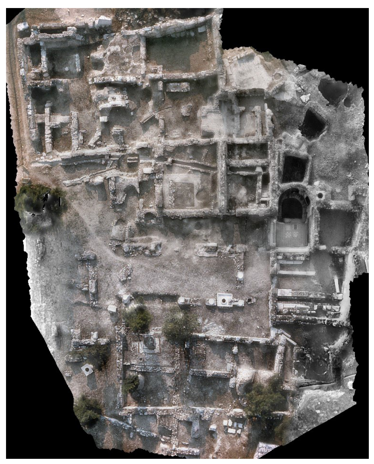
Figure 3. Omega house modelled from 1972 photographs