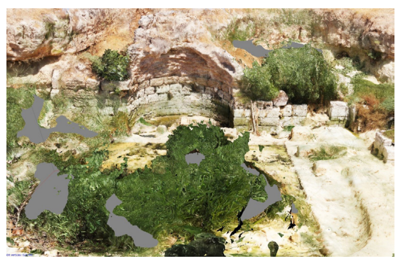
Figure 1. Fountain of the Lamps 3D modelling in 2012

the bedrock and supplied by natural springs. While the site was able to survive intact since the late third century b.c.(Wiseman 1970), once excavated, deterioration began. Currently, the bath areas have collapsed and the pool area is inundated with reeds and fig trees. Walls have fallen and the entire area cannot be studied safely in its present state. Wiseman found that "other connecting structures, almost certainly including a fountainhouse, were in use during the late third century b. c. and into the next century" (Wiseman 1970). He, as an end user of photogrammetry, has expressed a desire to re-examine certain aspects of the site that are no longer available. We have all photographed elements and events at a time when we felt we had fully documented them only to find afterwards that there are gaps in our recording. Through retrospective photogrammetry, aspects of the site have been able to be recreated and can be re-examined from perspectives that were not initially recorded.