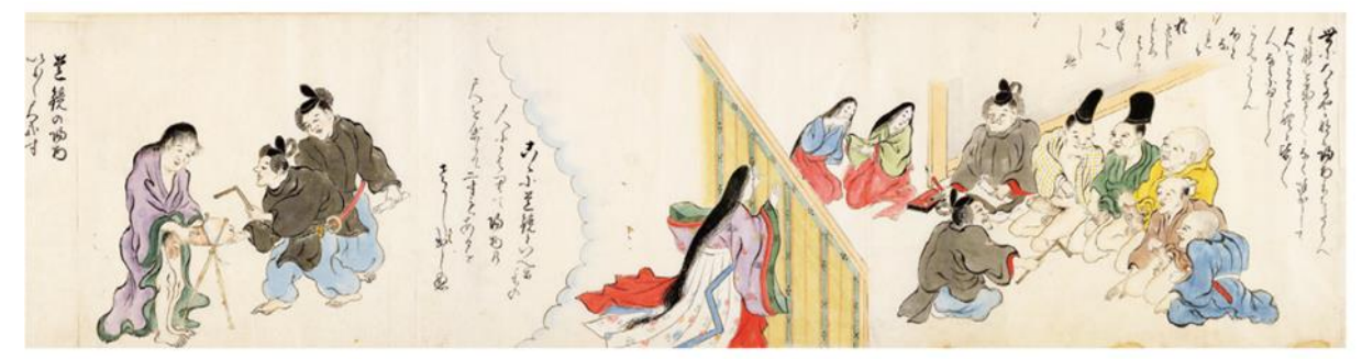
Figure 9. Dokyo choho no zu, detail. Art Research Center, Ritsumeikan University, hayBKE6-0013.